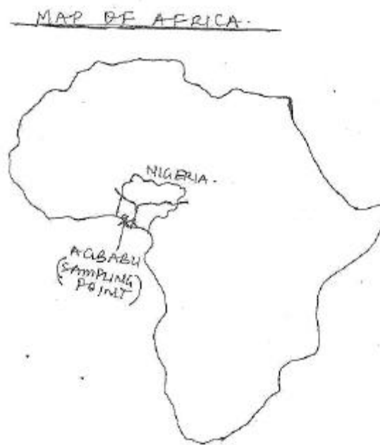
Fig. 1: Map of Africa Showing Sampling Point

Heavy metal contamination in soil is a major concern because of their toxicity and threat to human life and the environment [1]. Heavy metals and other pollutants such as polycyclic aromatic hydrocarbons are major components of petroleum hydrocarbons including bitumen [2]. Toxic heavy metals entering the ecosystem may lead to geo-accumulation, bio-accumulation and bio-magnifications. They get accumulated in time in soils and plants and would have a negative influence on physiological activities of plants (e.g. photosynthesis, gaseous exchange and nutrient absorption) determining the reductions in plant growth, dry matter accumulation and yield [3]. Heavy metals get into plants via adsorption which refers to binding of materials onto the surface or absorption which implies penetration of metals of metals into the inner matrix. Both mechanisms can also occur [4]. In small concentrations,