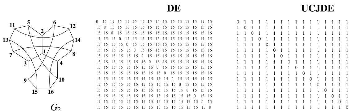
Figure 2. Detour and Cluj Detour matrices of a full Hamiltonian detour FHA graph G_2 .

There exist graphs with all the vertices internal endpoints and their detours are actually Hamiltonian paths. Such a graph (an example is given in Figure 2) we call full Hamiltonian detour FHA graph. 10